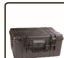
Plastic seal box