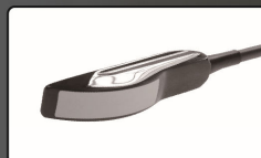
4.0MHz convex rectal probe