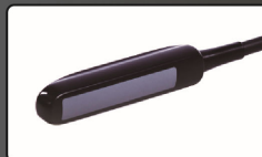
6.5MHz linear rectal probe